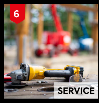
We take care of your project from the very first idea to the end of its lifespan.

Documentation for building permits and production drawings down to the smallest detail.